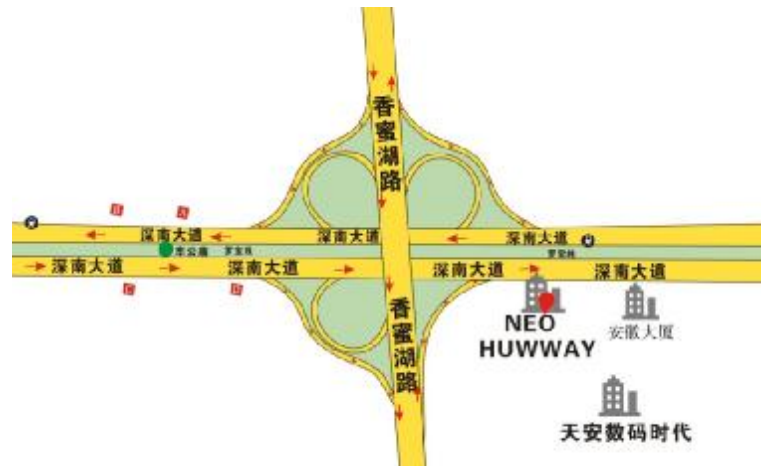
HUEWAY GUIDE MAP